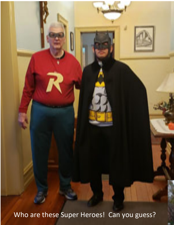
Who are these Super Heroes! Can you guess?