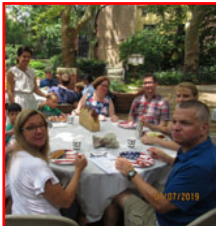
PARISH PICNIC IN THE PARK JULY 7, 2019