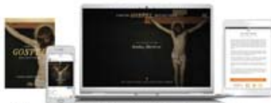
Journey through the Gospel this Lent with Bishop Barron!

Journey with Bishop Barron and over 300,000 others this Lent by reflecting on the daily Gospel reading! When you sign up for Bishop Barron’s Lenten Gospel Reflections, you’ll receive a short meditation from Bishop Barron in your inbox each morning on that day’s Gospel. It’s a simple, quick, and powerful way to keep your mind and heart focused on Christ throughout this penitential season. Just go to: www.lentenreflections.com to sign up. It’s free!