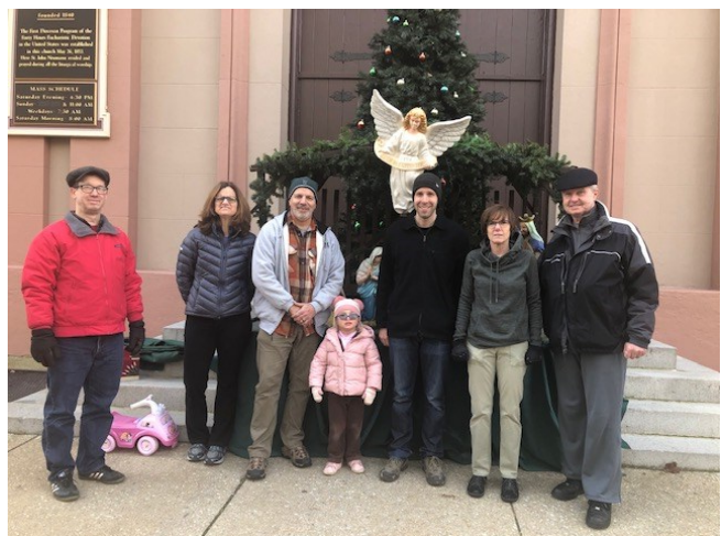
A big THANK YOU to the elves who put up our outside Christmas Tree and Manger.