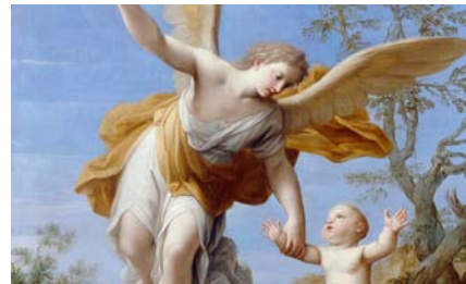
THE GUARDIAN ANGEL • Marcantonio Franceschini