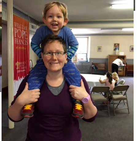
Community After Mass