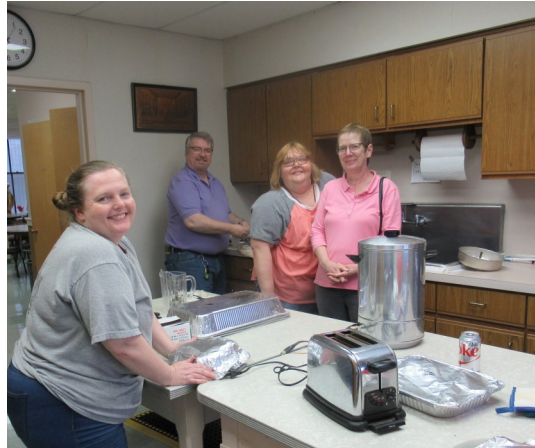
MOTHER'S DAY BRUNCH 2018