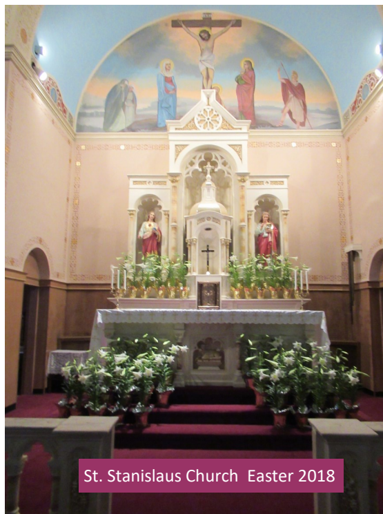
St. Stanislaus Church Easter 2018