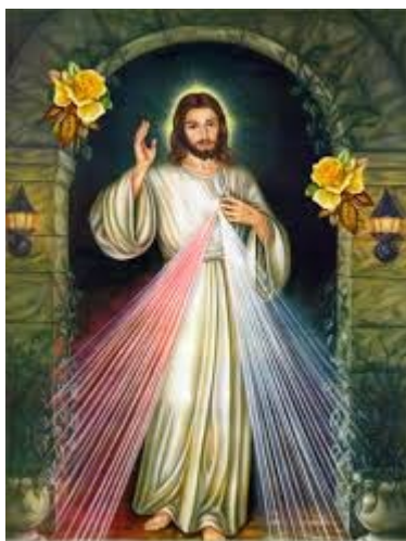
Jesus, I trust in Thee