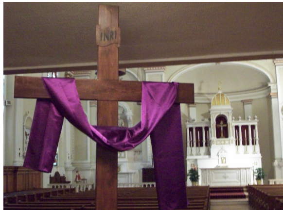
Stations of the Cross Fridays in Lent 7:00 p.m. at St. Philip Neri Church

Please take an egg from the basket and purchase the affordable item listed inside. Return the item to the collection box by Easter Sunday