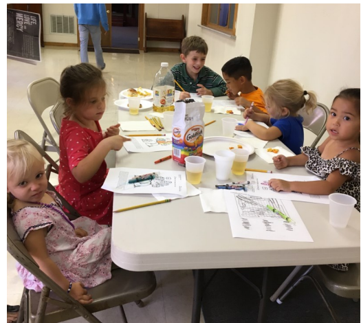
KIDS CAM - AFTER 11:00 A.M. MASS HAVE FUN DOING CATHOLIC ACTIVITIES WITH OTHER KIDS FROM THE PARISH

Stations of the Cross begin Friday February 16 at 7:00 p.m. SPN