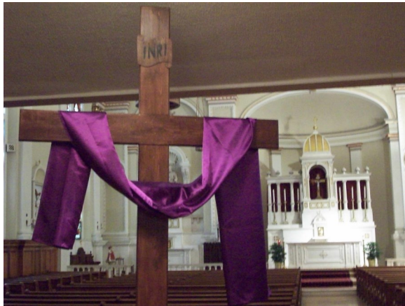
Stations of the Cross Fridays in Lent 7:00 p.m. at St. Philip Neri Church