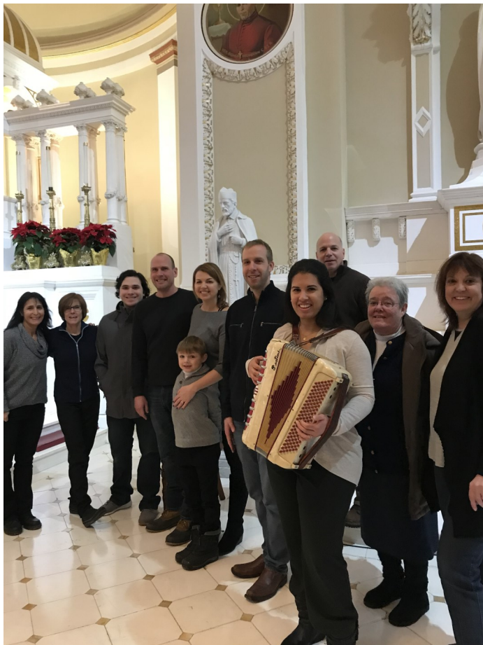
THANK YOU to those who helped with putting away the Christmas Decorations.!