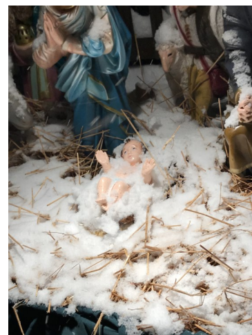
BABY JESUS IN THE SNOW