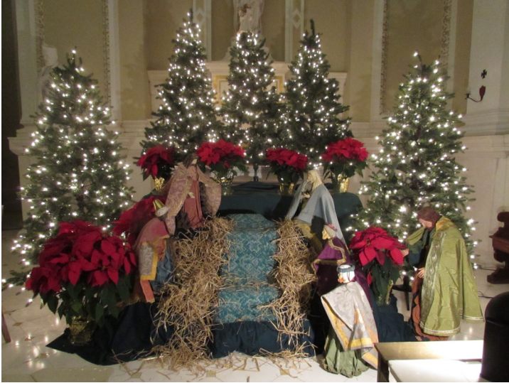
AWAITING THE BABY JESUS