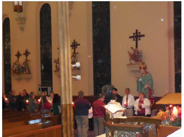
PROCESSION TO THE CRIB