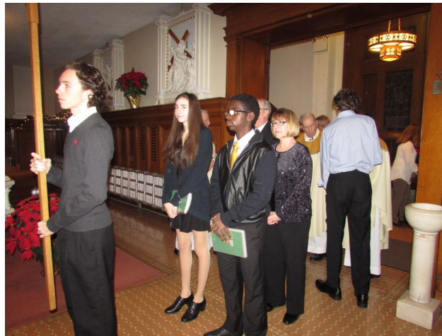
THE PROCESSION FORMING