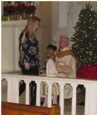
O COME LET US ADORE HIM