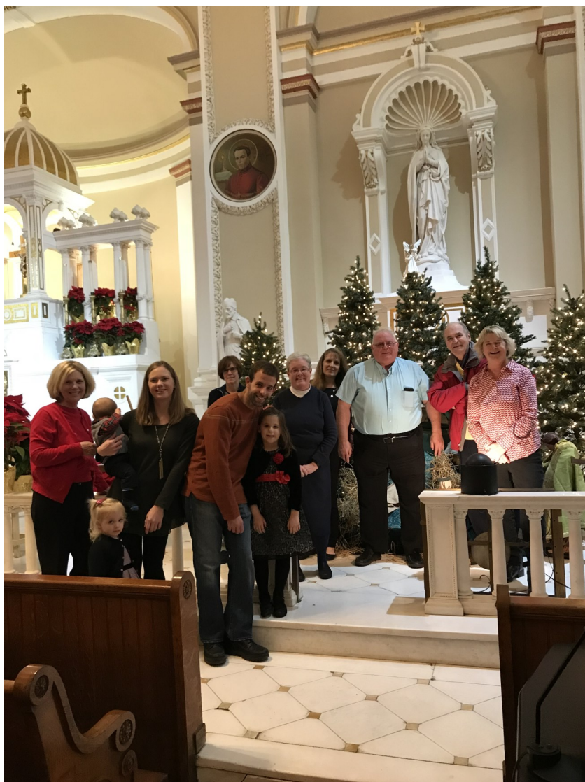
SOME OF SANTA'S HELPERS WHO HELPED BEAUTIFY THE CHURCH.