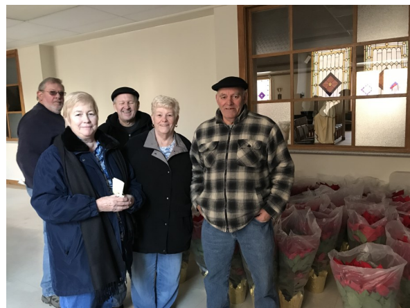
POINSETTIA POINT PERSONS