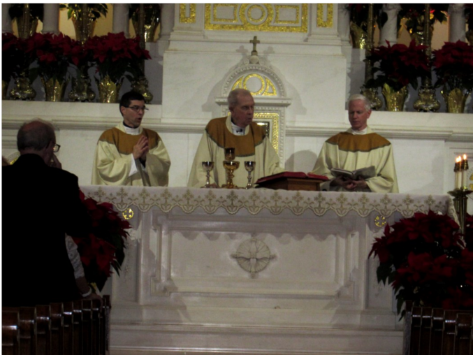
LITURGY OF THE EUCHARIST