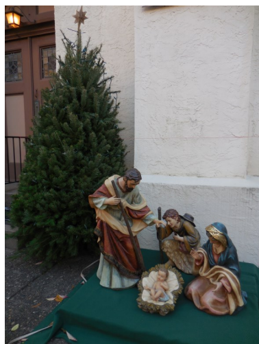
OUR BEAUTIFUL NATIVITY AND LIVE TREE.