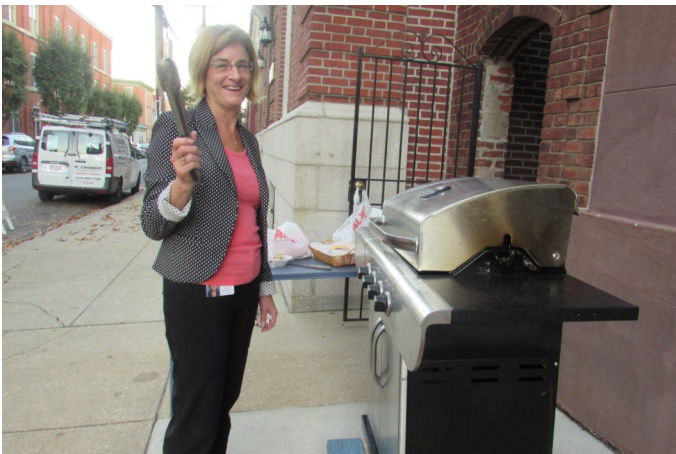
FRANKFURTERS FOR THE HUMANS