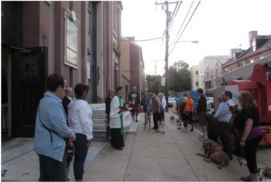
BLESSING ON QUEEN STREET