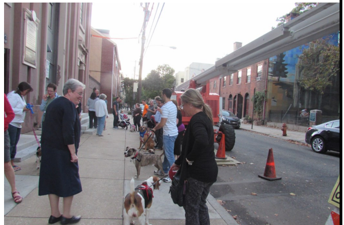
DOG TREATS FOR OUR FURRY FRIENDS